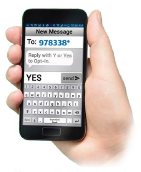
*if your number is Canada-based.

You can also opt out of these messages at any time by simply replying to one of our messages with "Stop".